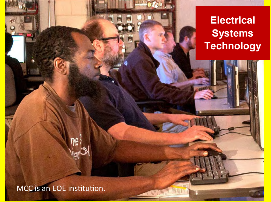
Electrical Systems Technology