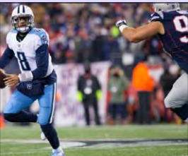
Tennessee Titans QB Marcus Mariota, receivers hold extra workout Page 18