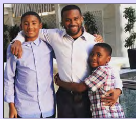
Black men share their lessons from fatherhood Page 8