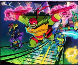
New 'Ninja Turtles' reboot film in development at Paramount Page 22