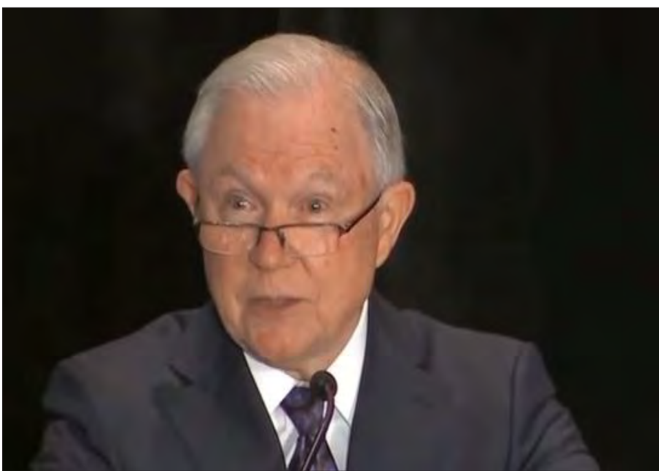
Attorney General Jeff Sessions

eral clearly misses the a fundamental message of Scripture which Jesus quoted as Good News, not the lies, harsh words and the meanness we see today.