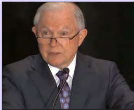
Hate Thy Neighbor Colors Sessions' Immigration Practices Page 12