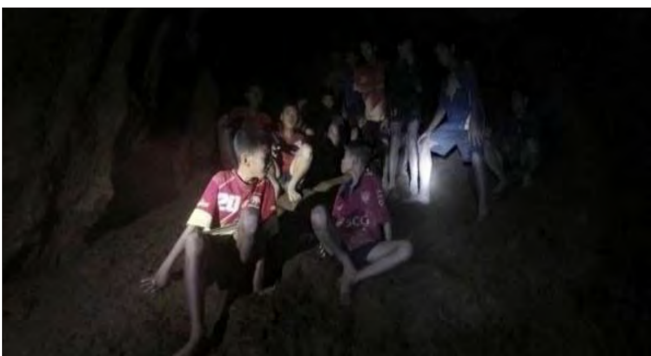
Rescuers found 13 missing members of a youth soccer team inside the cave complex at Tham Luang cave in Khun Nam Nang Non-Forest Park, Chiang Rai, and are working to bring them out.

In the meantime, doctors will conduct medical checks on the boys and attempts were being made to set up a phone line for