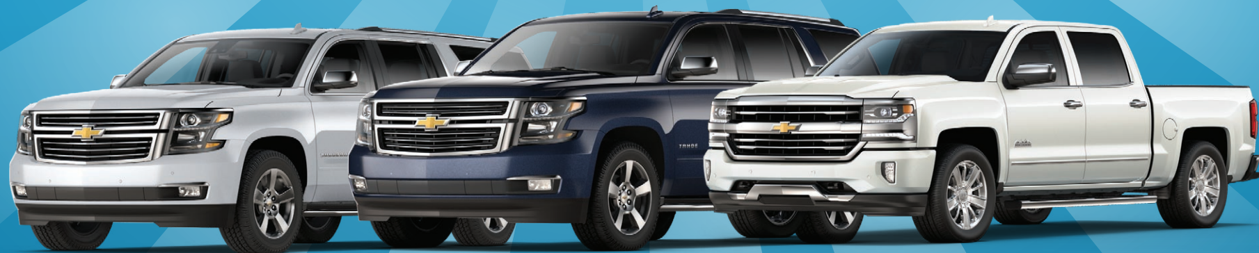
ALL NEW 2017 SUBURBAN