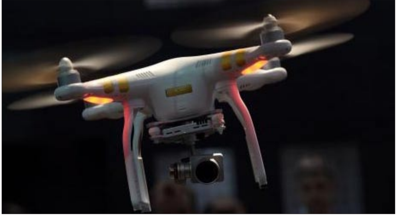
que cortó los videos de varios vuelos y luego los unió para que pareciera que fuese uno solo.