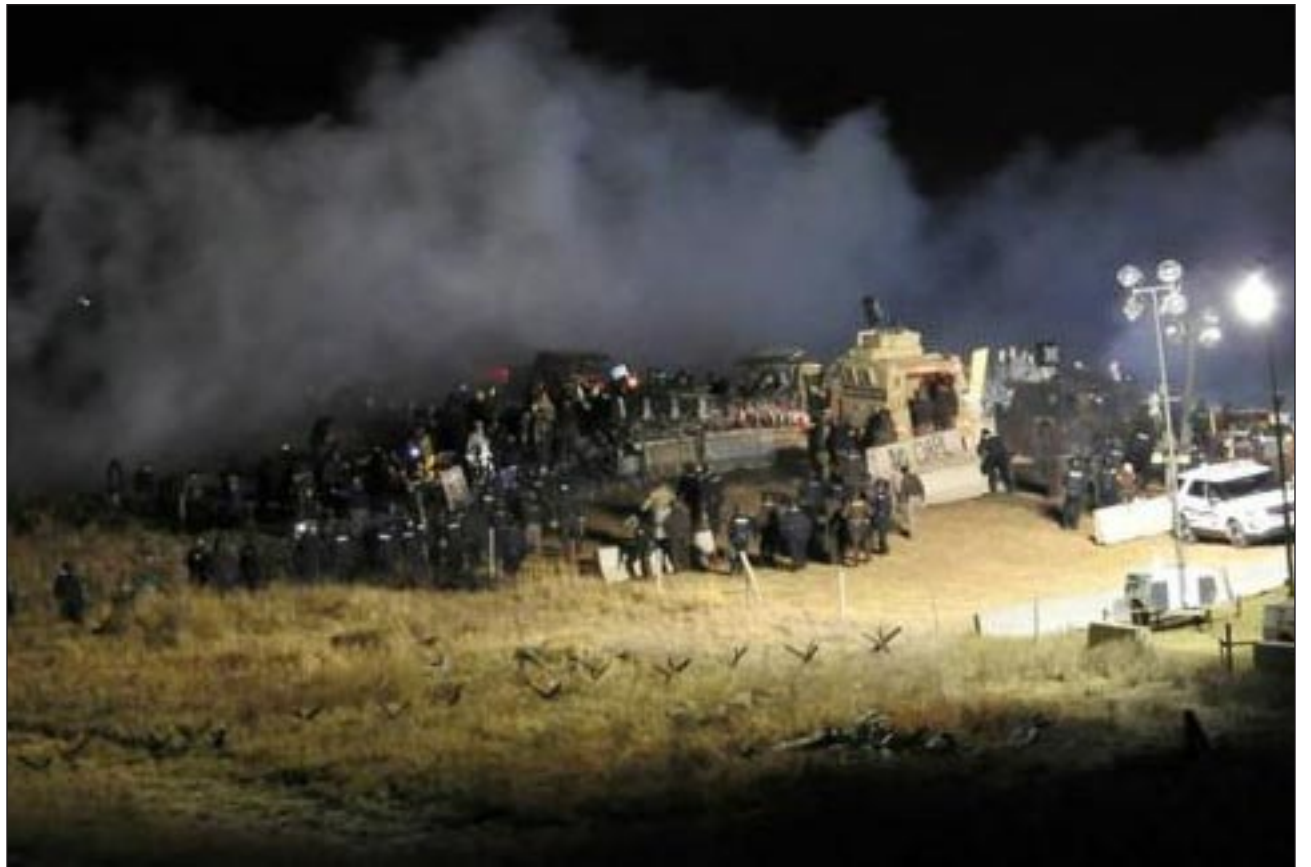
Police and protesters clash on the Backwater Bridge, north of a protest camp in North Dakota's Morton County on November 20. The U.S. Army Corps of Engineers published a notice it's initiating an environmental impact statement related to the routing the Dakota Access pipeline under Lake Oahe in North Dakota.

At least 589 protesters have been arrested, including three on Monday.