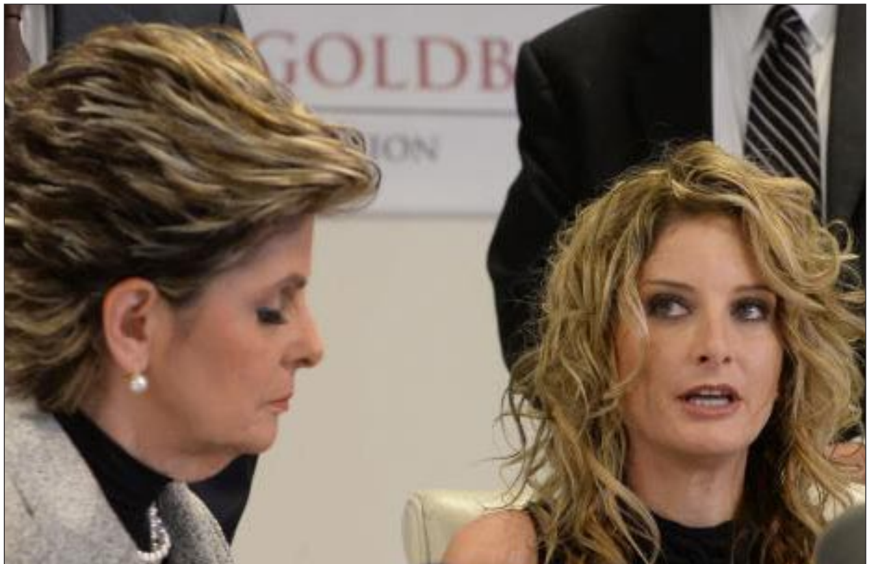
Summer Zervos, at right, a former contestant on The Apprentice, who previously accused Donald Trump of making unwelcome sexual advances toward her, kissing her on the lips and groping her in a Beverly Hills hotel, attends a news conference in Los Angeles with her attorney Gloria Allred to announce the filing of a defamation lawsuit against the president-elect over his denials of her allegations on January 17, 2017.

Through a spokesperson, Trump called the suit "more of the same from Gloria Allred. There is no truth to this absurd story."