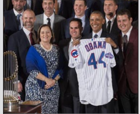
Chicago Cubs feted at White House for World Series title Page 8