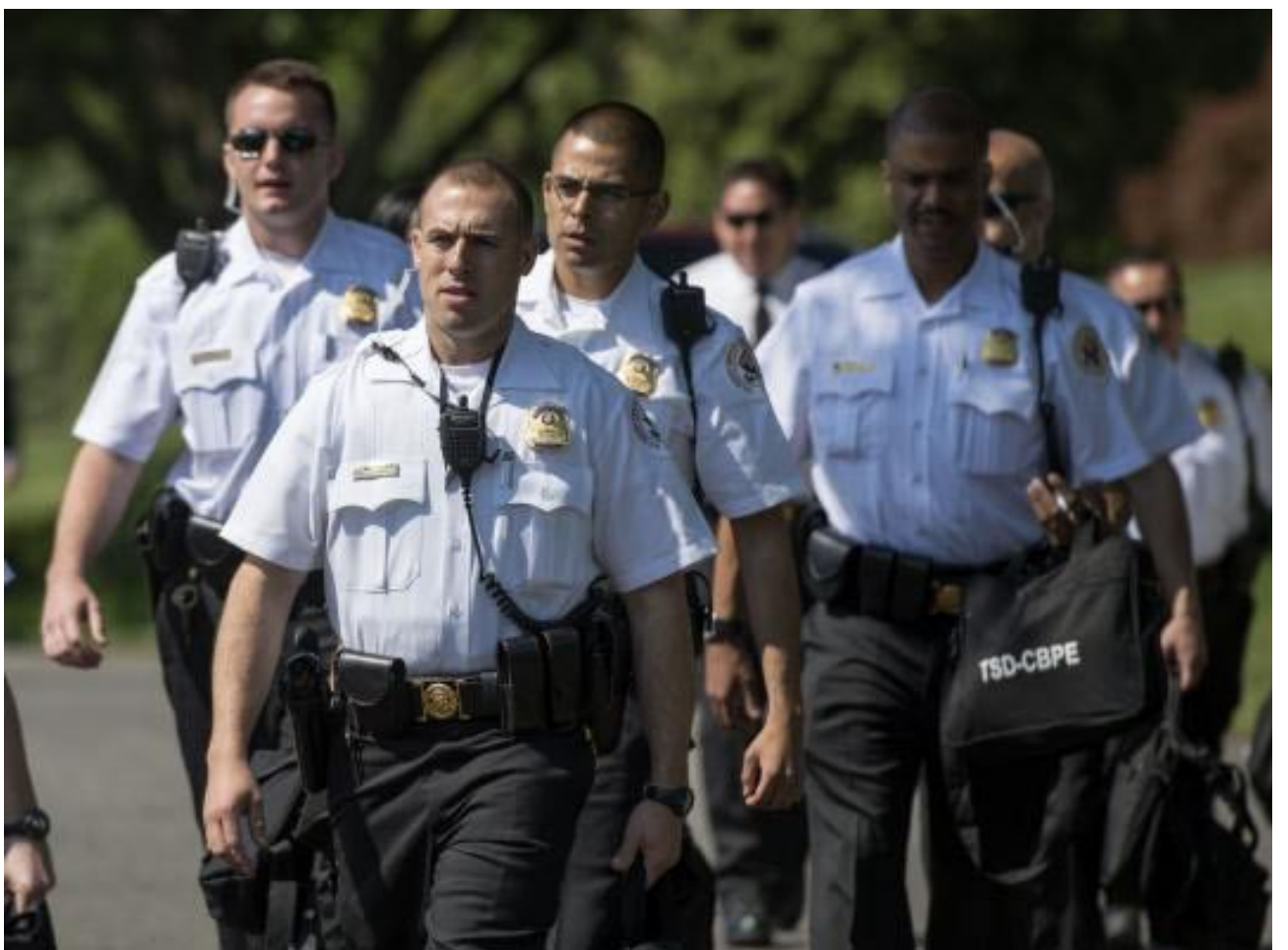
Members of the Secret Service Uniformed Division are seen on the South Lawn of the White House on May 4, 2015 in Washington, D.C. A settlement to a racial discrimination suit, in which nearly 100 African-American agents said they were denied promotions because of their race, was announced Tuesday.

The settlement talks were driven largely by Secretary of Homeland Security Jeh Johnson, whose agency includes the Secret Service. The settlement comes at the end of an eight-year period in which the Secret Service's primary job has been to protect the United States' first African-American president; it also follows a period in which the Secret Service changed its senior management structure and endured several embarrassing incidents regarding its agents. "I am pleased that we are able to finally put this chapter of Secret Service history behind us," said Johnson. "Had the matter gone to trial, it would have required that we re-live things long past, just at a time when the Secret Service is on the mend."