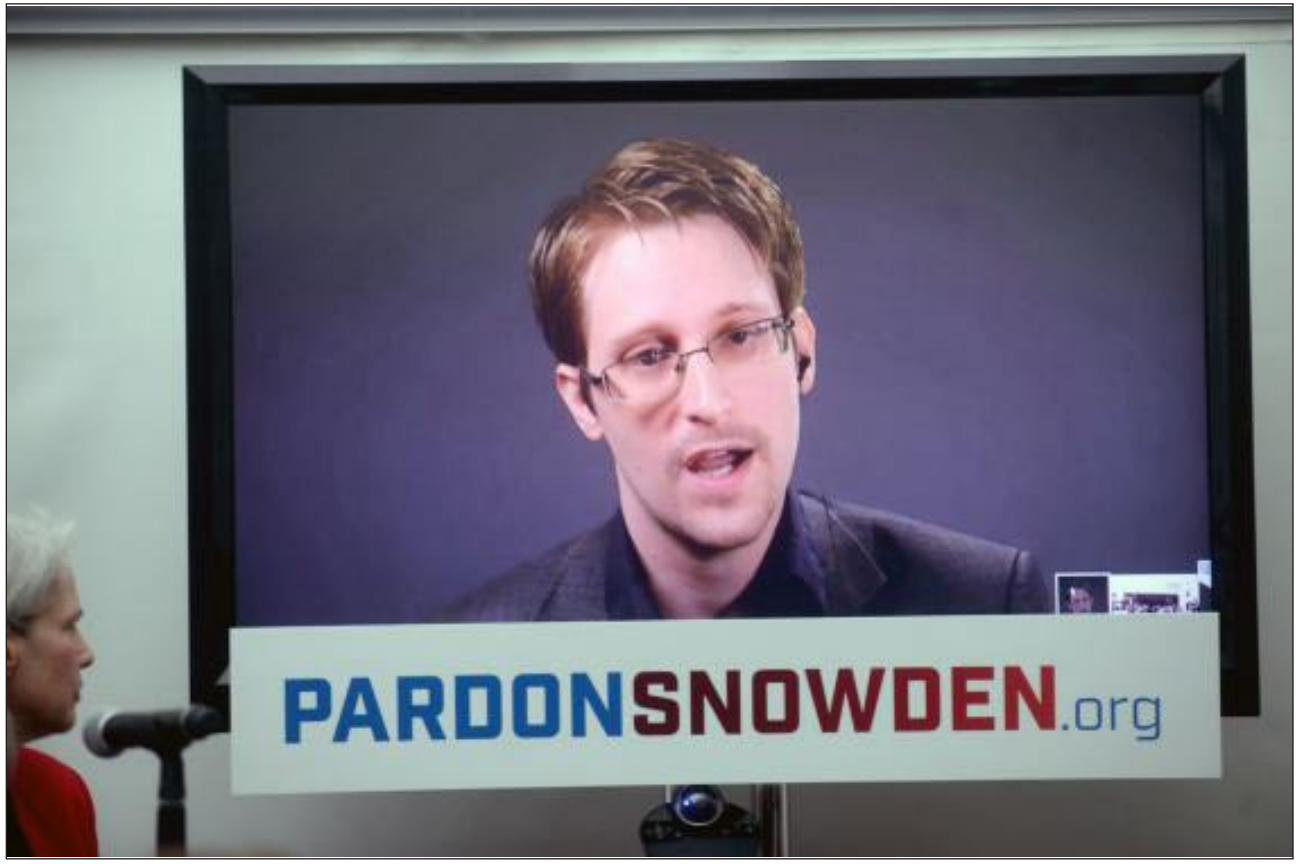
Edward Snowden speaks from Russia via monitor at a New York conference on September 14. A Russian Foreign Ministry spokeswoman said Wednesday that Snowden's leave to remain in Russia was extended to 2020.

While Snowden has not commented on the extension of his invitation to stay in Russia, he offered thanks to Obama for freeing Manning.