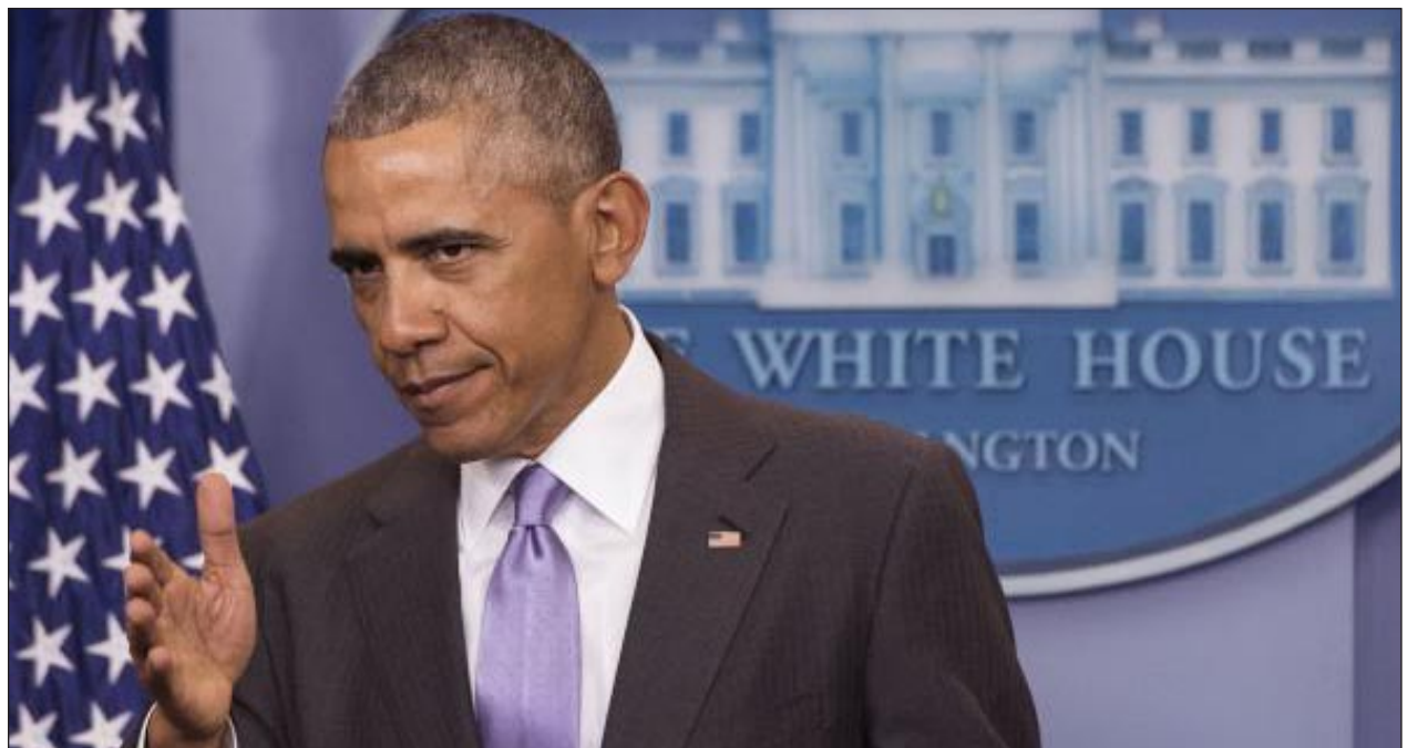
President Barack Obama speaks to the media as he attends the final White House press briefing of his administration, in Washington, D.C., Wednesday. Obama leaves office with a 60 percent job approval rating in an ABC News/Washington Post poll.