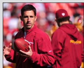
San Francisco 49ers expected to hire Kyle Shanahan Page 9