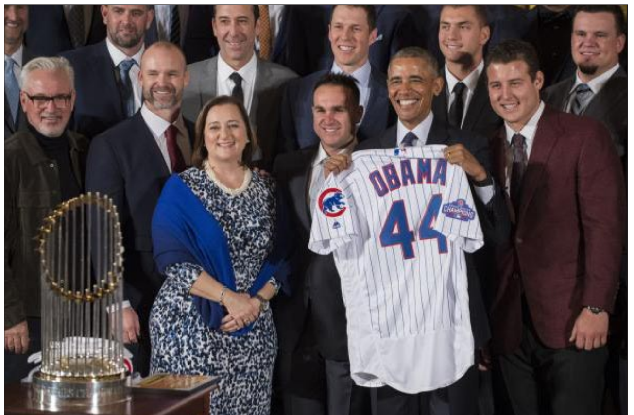
President Barack Obama hold up his Chicago Cubs jersey during a ceremony honoring the Cubs in the East Room of the White House in Washington, D.C., on January 16, 2017. The Cubs won Major League Baseball's World Series in October. Next to Obama is co-owner Laura Ricketts and first baseman Anthony Rizzo. At left is manager Joe Maddon.

Obama said on Martin Luther King Day that "sports has the power to bring us together even when we're divided.