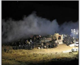
Army Corps of Engineers launches Dakota Access study Page 6