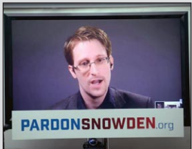
tends Edward Snowden's stay to 2020 Page 3