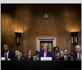
Billionaire DeVos promises no business conflicts with education post Page 2