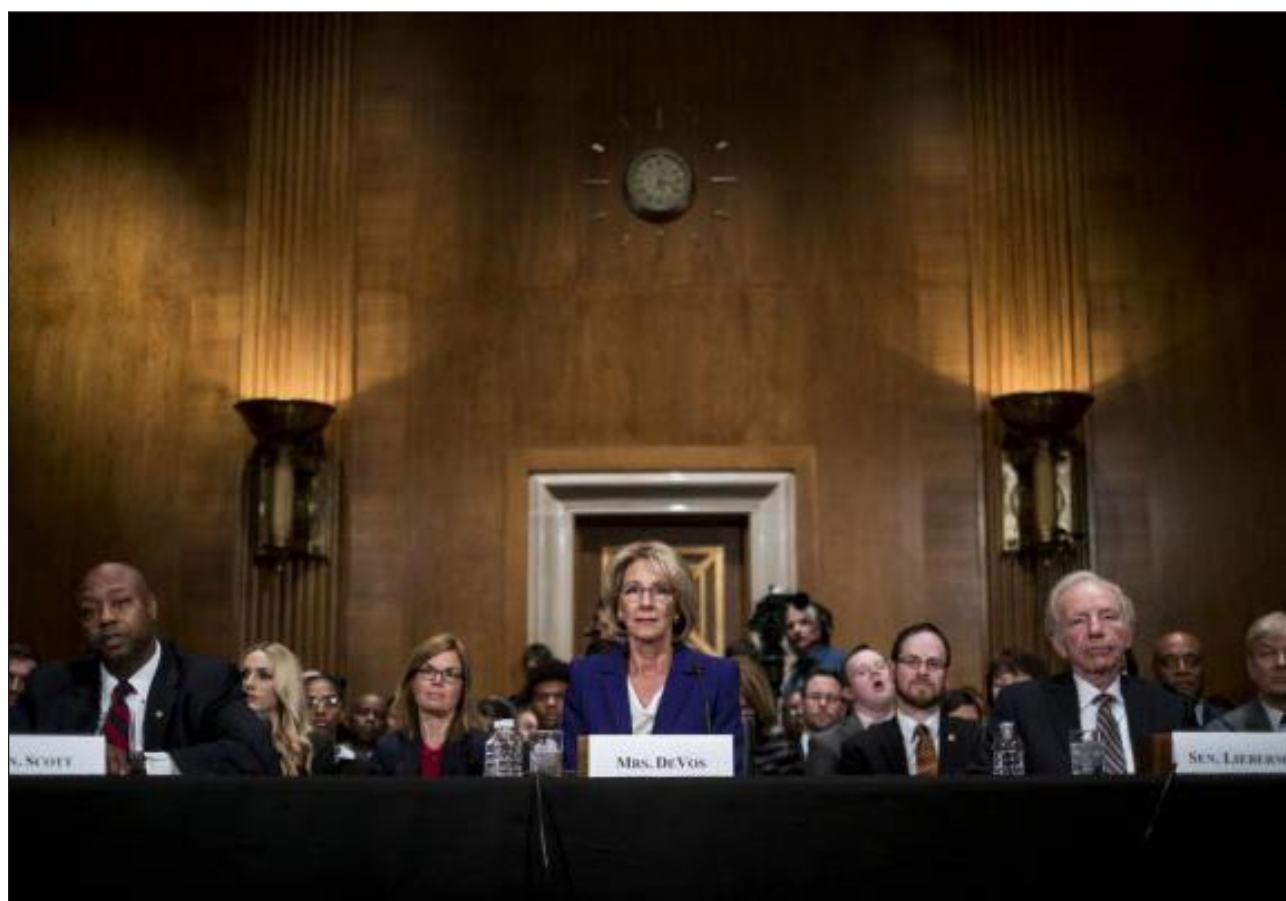
Senator Tim Scott, R-S.C., and former senator Joe Lieberman flank Betsy DeVos, President-elect Donald Trump's pick for education secretary, as they prepare to introduce her before the Senate Committee on Health, Education, Labor and Pensions during her confirmation hearing on Tuesday.

Though DeVos has a track record in advocating for educational matters, some have expressed concern that her significant investments in education-related enterprises, such as a loan refinancing company, could bring about various conflicts of interest -- much in the same way skeptics are concerned Trump's businesses could interfere with his duties as