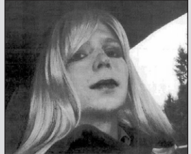
Obama commutes 209 more sentences, including Chelsea Manning's Page 4