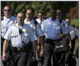
Secret Service settles racial bias suit for $24 million Page 3